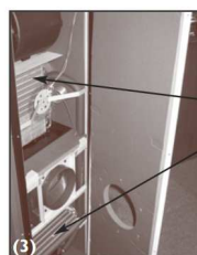
Ailettes des 2 échangeurs

For this complete maintenance, please contact your EuroCave dealer, who can refer you to a refrigeration specialized technician.